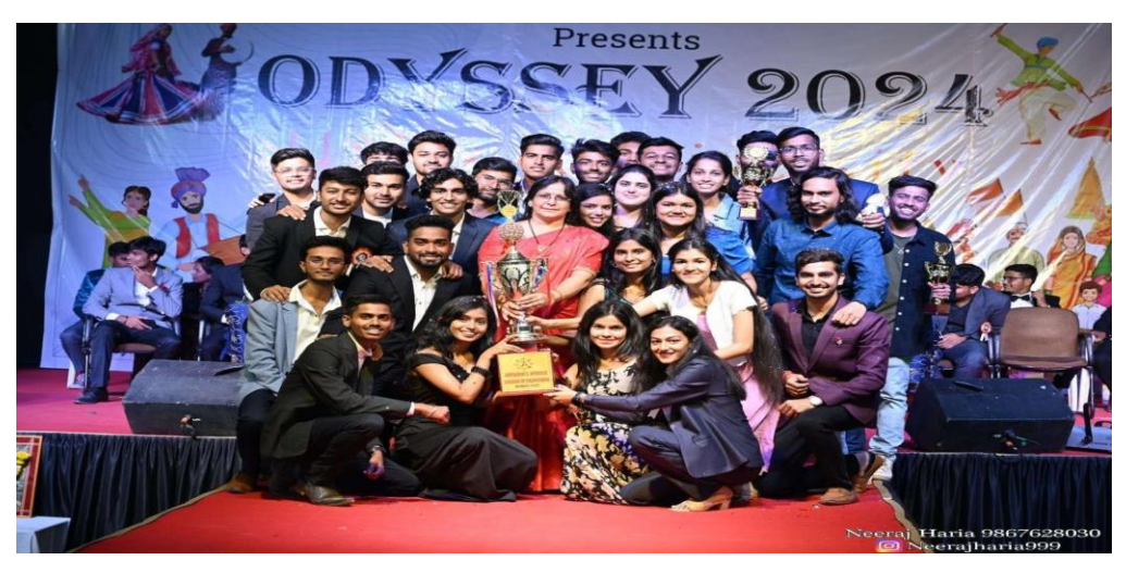
Winners Kridaratna 2023-24(Computer Department)

After that the most prestigious award of Jondhale "Kridaratna" is awarded to the Departments who have done exceptionally well in sports and won most points.